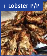
1 Lobster P/P