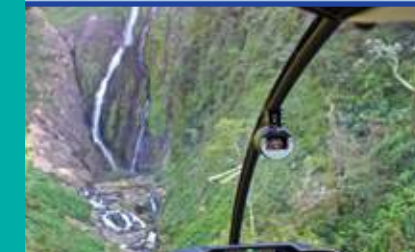
50 Minutes Roundtrip

Nestled deep in the Cordillera Oriental Mountain Range and surrounded by a lush tropical rain forest is the highest waterfall in the Caribbean, Salto La Jalda. The unspoiled beauty of this natural wonder is the perfect place to ask that someone special to marry you or to just enjoy an intimate picnic on the rocks surrounding the fresh water pool.