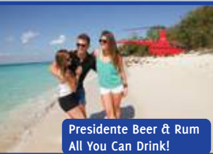
Presidente Beer & Rum All You Can Drink!