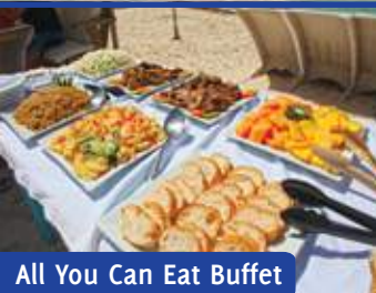
All You Can Eat Buffet

The Exotic Island Excursion to Saona is an adventure within an adventure! One of the most beautiful Islands in the Caribbean, Saona offers pristine beaches and a relaxing environment among the palm trees and warm tropical breezes!