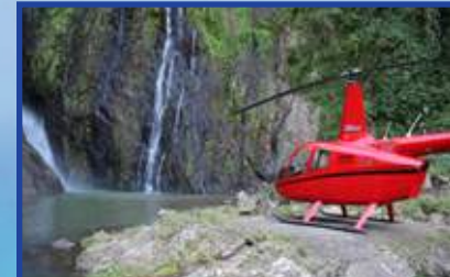
Picnic Lunch Included