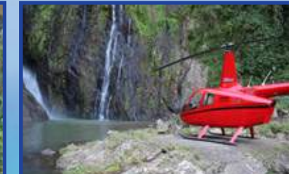
Picnic Lunch Included