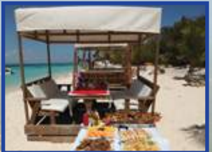
1 Lobster P/P