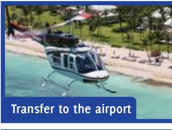
Transfer to the airport