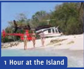
1 Hour at the Island