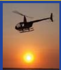
15 Minute Flight