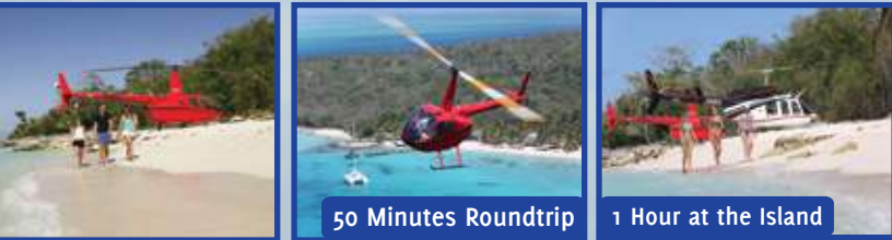
50 Minutes Roundtrip