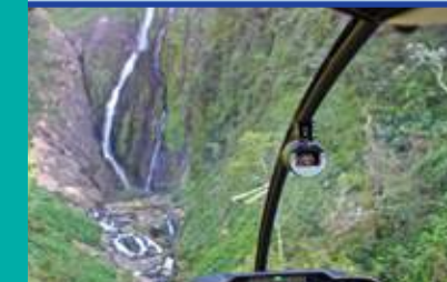
50 Minutes Roundtrip

Nestled deep in the Cordillera Oriental Mountain Range and surrounded by a lush tropical rain forest is the highest waterfall in the Caribbean, Salto La Jalda. The unspoiled beauty of this natural wonder is the perfect place to ask that someone special to marry you or to just enjoy an intimate picnic on the rocks surrounding the fresh water pool.